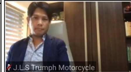
J.L.S Triumph Motorcycle